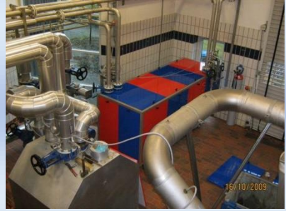
Sludge / Sludge 13 m 3 / 7 m 3 / h