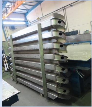
Sludge / Sludge 16 m 3 / h