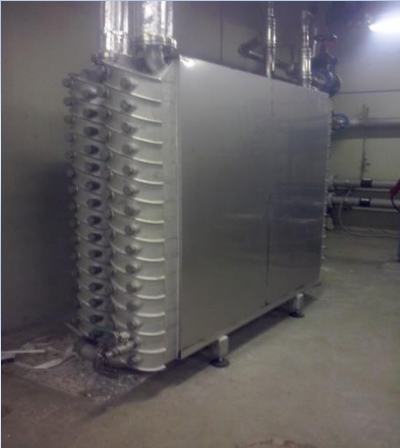
Sludge / Water 16 m 3 / h