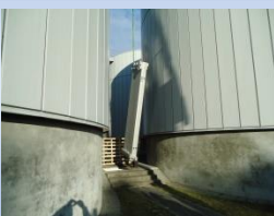
Sludge / Sludge 8 - 10 m 3 / h