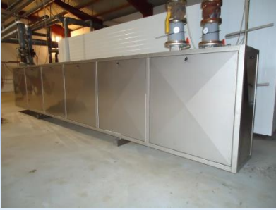
Manure / Manure 8 m 3 / h